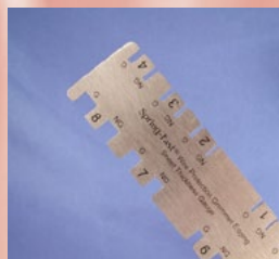
'Go/No-Go' Sheet Thickness Gauge