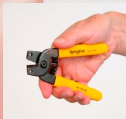
Full Bypass Cut Off Shears